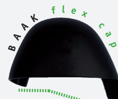
foot fitting instead of straight