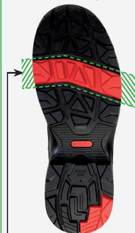
flex zone in the ball section